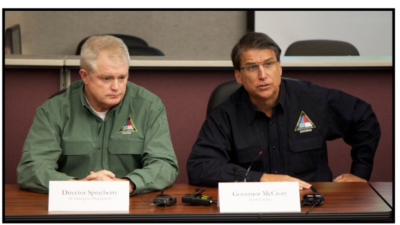
Legislative Overview I. 2016 Legislative Summary

These are only a few examples of changes made by the Legislature during the short session.