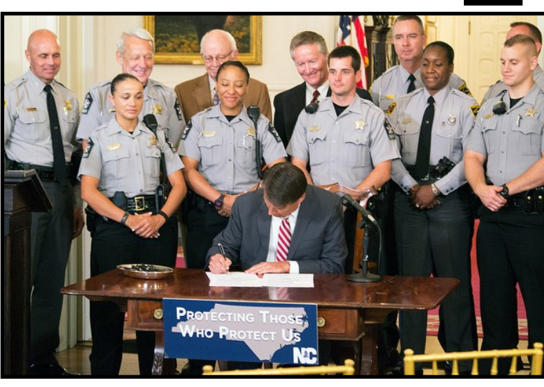
Governor McCrory signing House Bill 1044 (Law Enforcement Omnibus Bill) and House 972 (Law Enforcement Recordings/No Public Record).

The Tarheel Challenge Program, a program for troubled youth offered through the National Guard, will receive $85,000 for new buses and $700,000 for