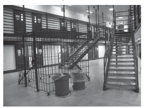
Close custody cellblock

Close Custody is for inmates who need extra security and are under armed constant supervision. Close custody housing is generally made up of single cells and divided into cellblocks. Case management, work assignments, basic education, counseling and