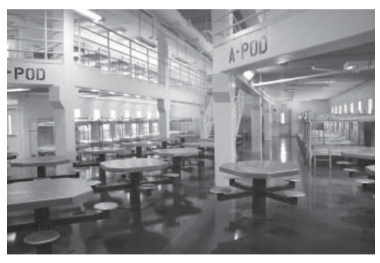
Minimum custody cellblock

All inmates undergo routine custody reviews, which determine if their custody is appropriately assigned. Progression (called promotion) to a