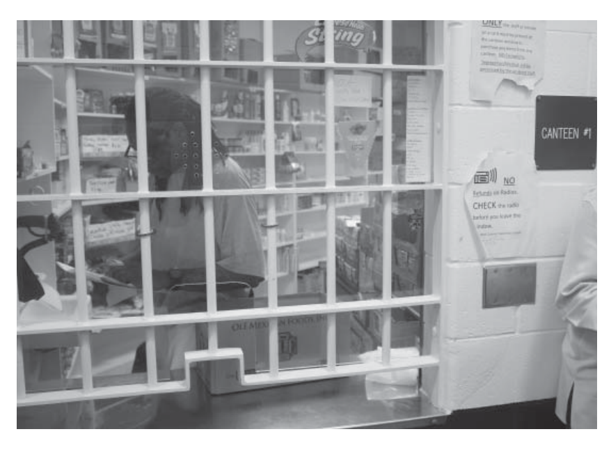
Correctional institution canteen

All prisons operate a cashless canteen where inmates buy items such as hygiene products, snack foods, soft drinks, watches, radios and stamps. Inmates are not allowed to have cash or coins on their person, but may spend up to $40 each week from their trust fund account for personal use using the cashless canteen. Prisons will provide basic hygiene items for inmates who do not have the monies to purchase them.