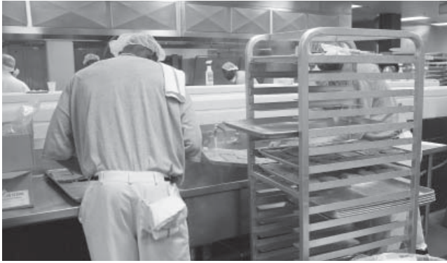
Inmates prepare meals under the supervision of correctional food service officers.

DPS has nine Food Service Technology Programs offered to inmates. The classes are taught by staff from community colleges statewide. Inmate bakers, cooks and stock clerks learn to follow menus, recipes, production sheets and inventory processes in class and on the job in prison kitchens.