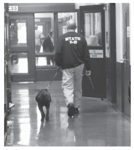
Canines are routinely used to search prisons for drugs and contraband.

An intelligence officer is assigned at each facility to monitor gang activity and to review the status of confirmed SRG members.