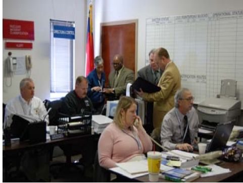
Harnett County EOC