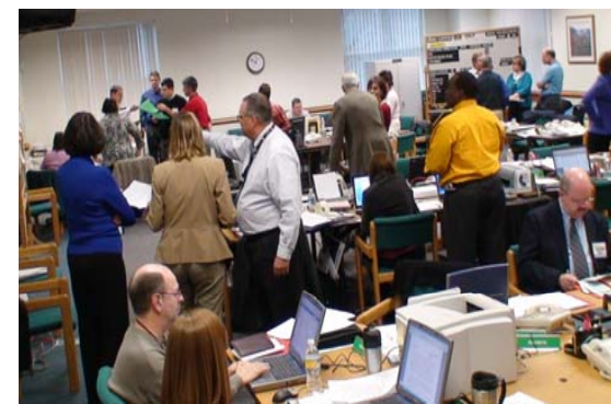
Joint Information Center

State, utility & county EOCs train together ~ March 3