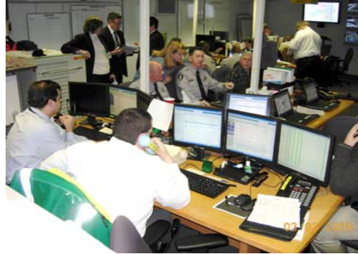
Wake County EOC